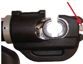
Head with Dies